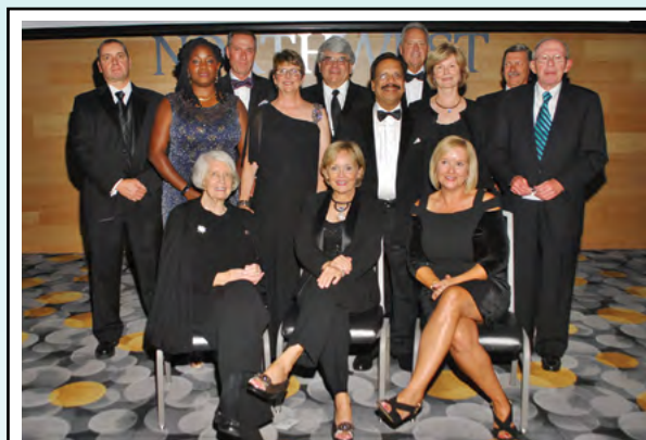
Unity Foundation of La Porte County board members, donors and community partners gathered to celebrate Unity's 25th Anniversary and Give Day in 2017.

An additional $20,000 in special prizes and $11,000 in Leave a Legacy prizes are available for participating funds to leverage as part of the event. Gifts and matching funds earned will be split evenly between endowment fund principal and spendable – providing money for today and forever. This is a fun way for participating funds to attract new donors and gifts to their Unity Foundation endowment fund.